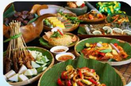
Daily Lunch Provided (Excluding Weekends)