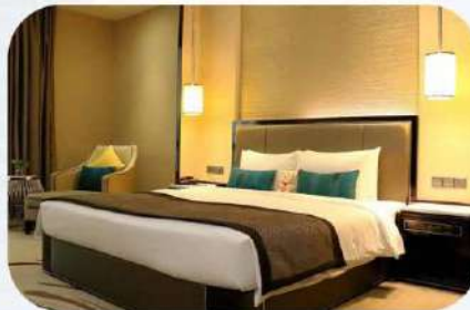
4 Star Accommodation