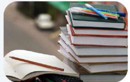
Book & Learning Materials