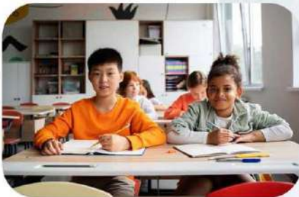
80 Hours English Language Classes