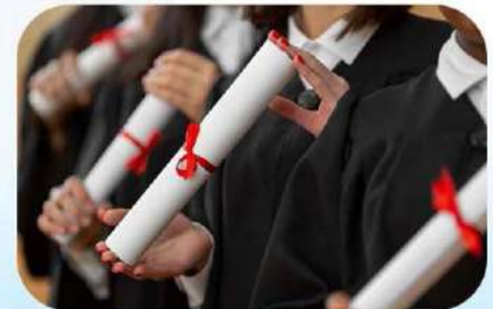
Closing Lunch Ceremony With Certificate & Photo Session