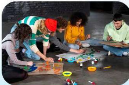
Over 10 Interactive Activities & Excursions