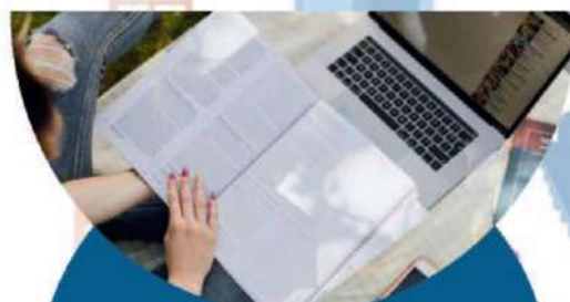
CONTENT & MATERIAL