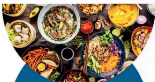
RESTAURANT & CAFE