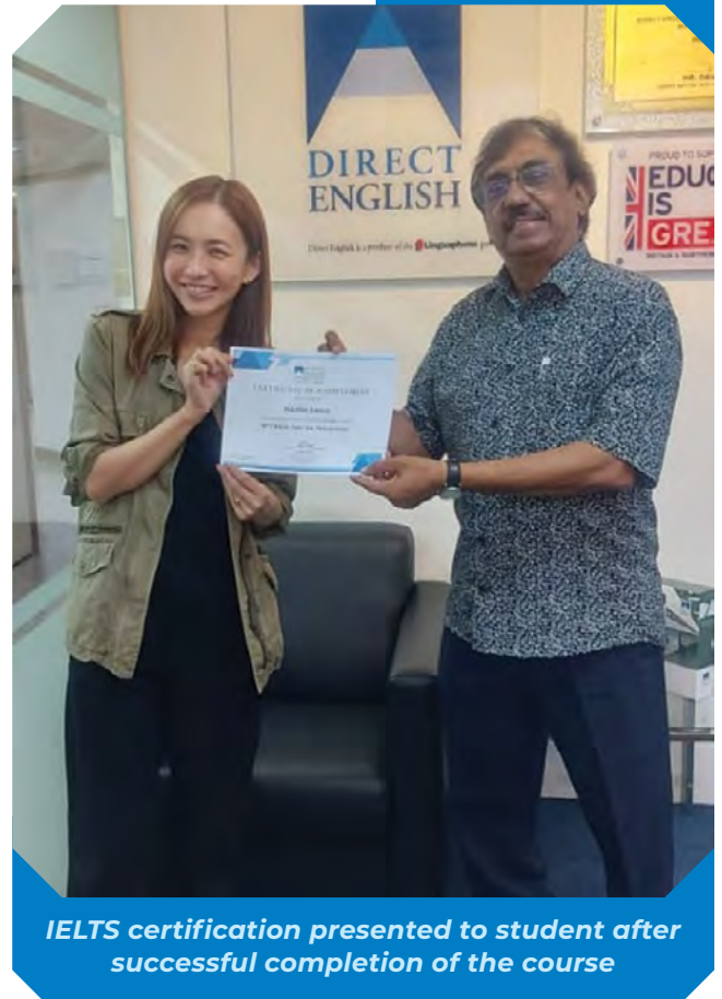
IELTS certification presented to student after successful completion of the course

At the same time, interest in IELTS preparation has seen a noticeable rise as more individuals position themselves for international study, career advancement, and migration opportunities. Recognised globally as a benchmark English proficiency test, IELTS opens doors to universities, employers, and institutions worldwide. The IELTS preparation programme is designed to equip learners with targeted strategies across all four key skills—Listening, Reading, Writing, and Speaking—ensuring they are confident, exam-ready, and able to achieve the band score required for their goals.